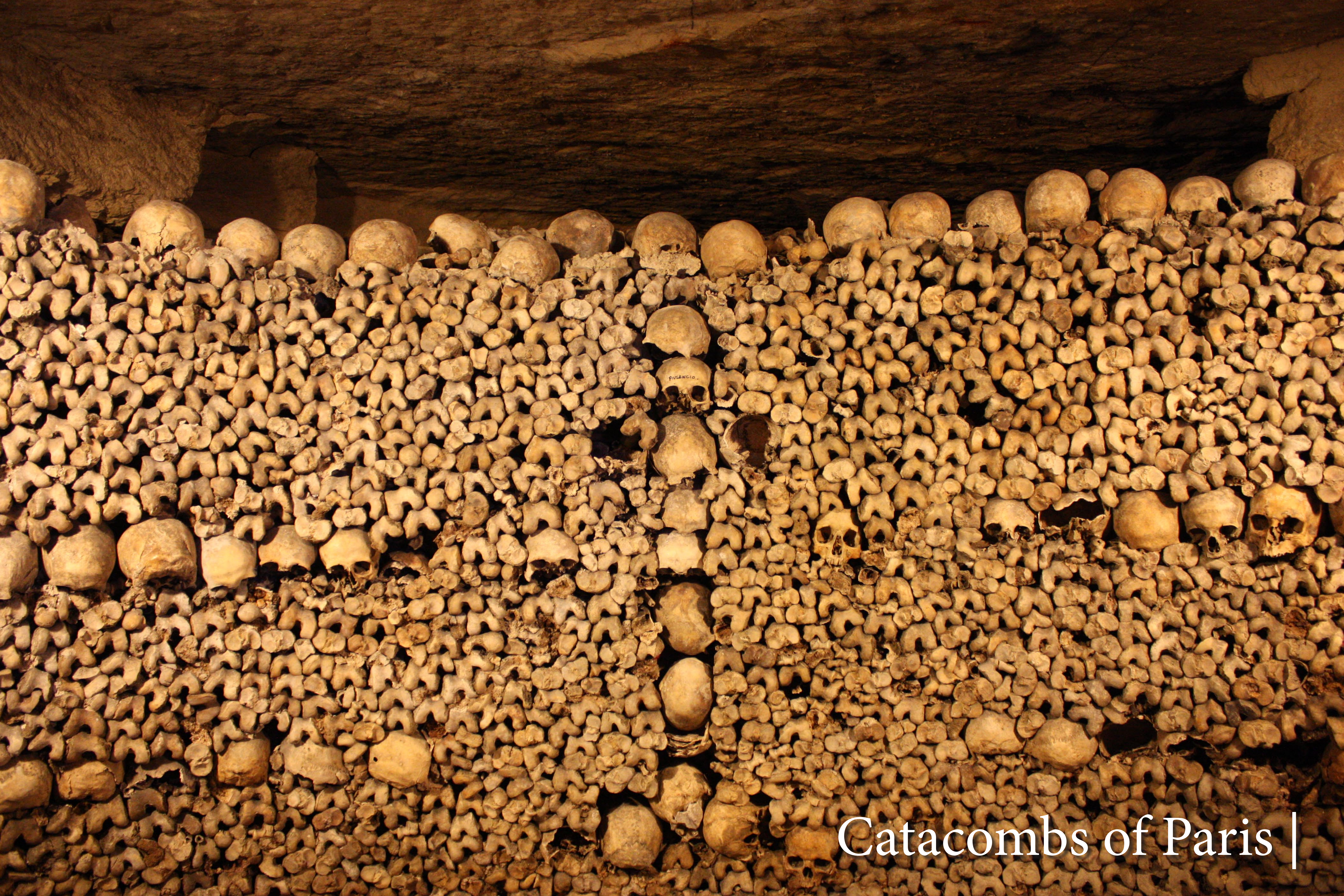
Catacombs of Paris |