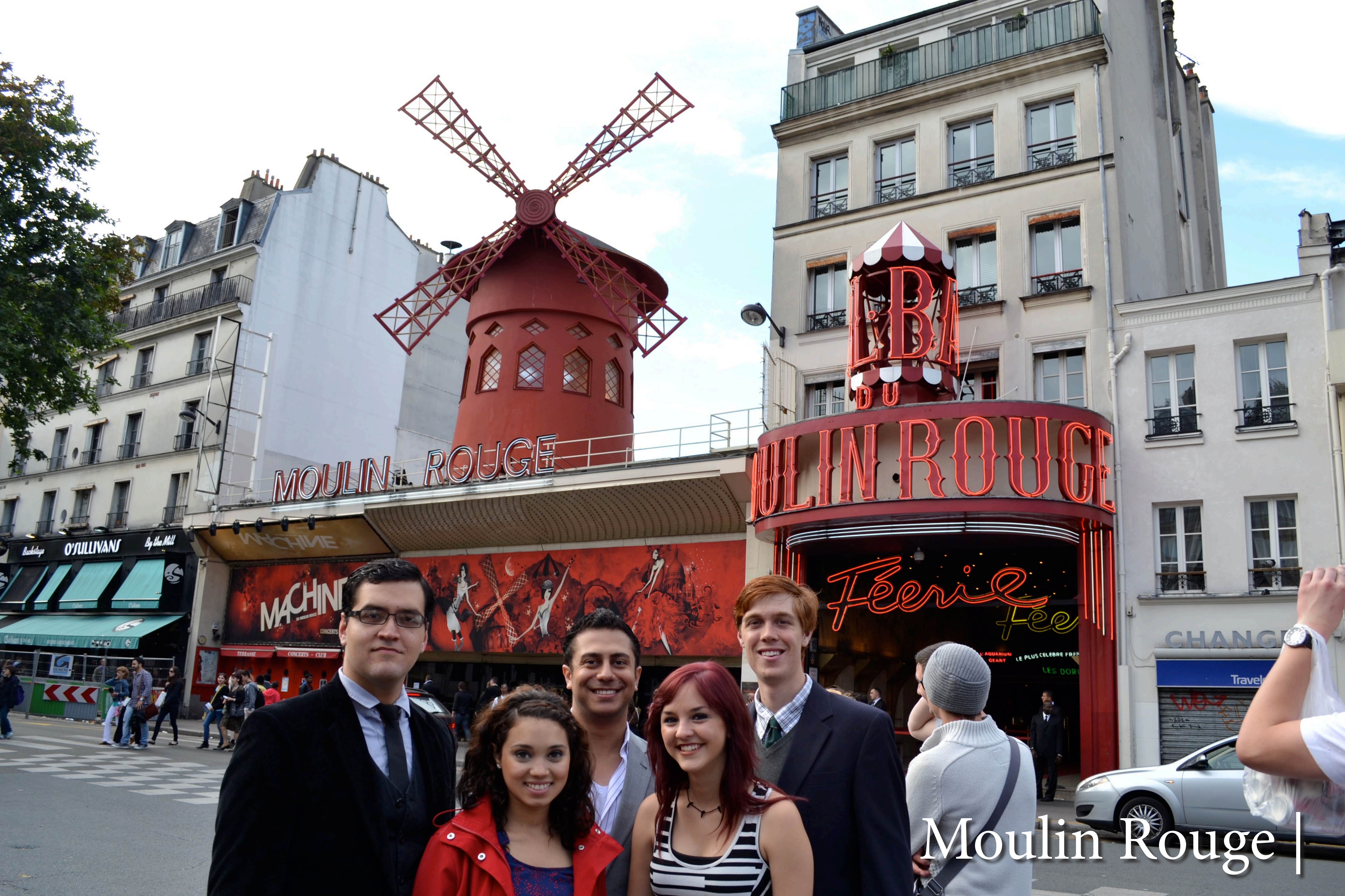
Moulin Rouge |